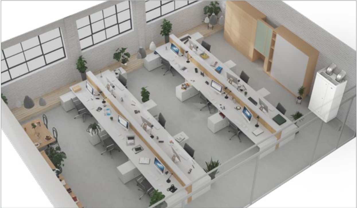
Reference example of floor-standing decentralised air handling unit