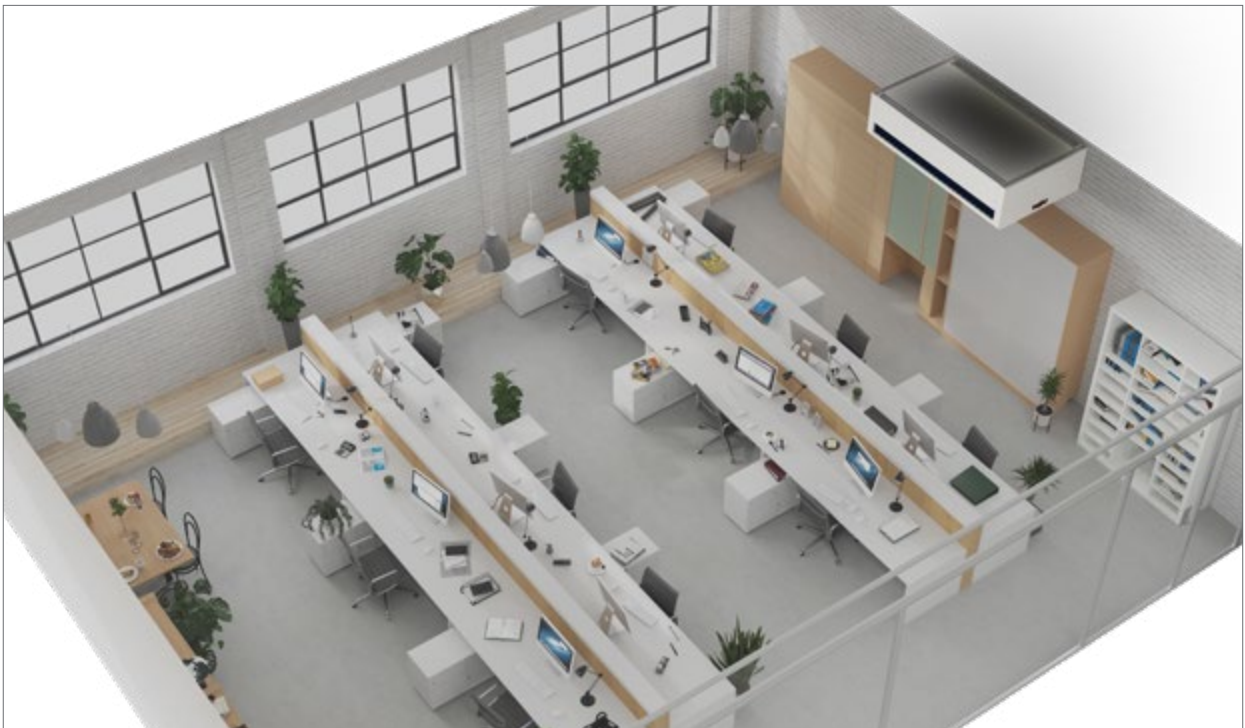
Reference example of ceiling-mounted decentralised air handling unit