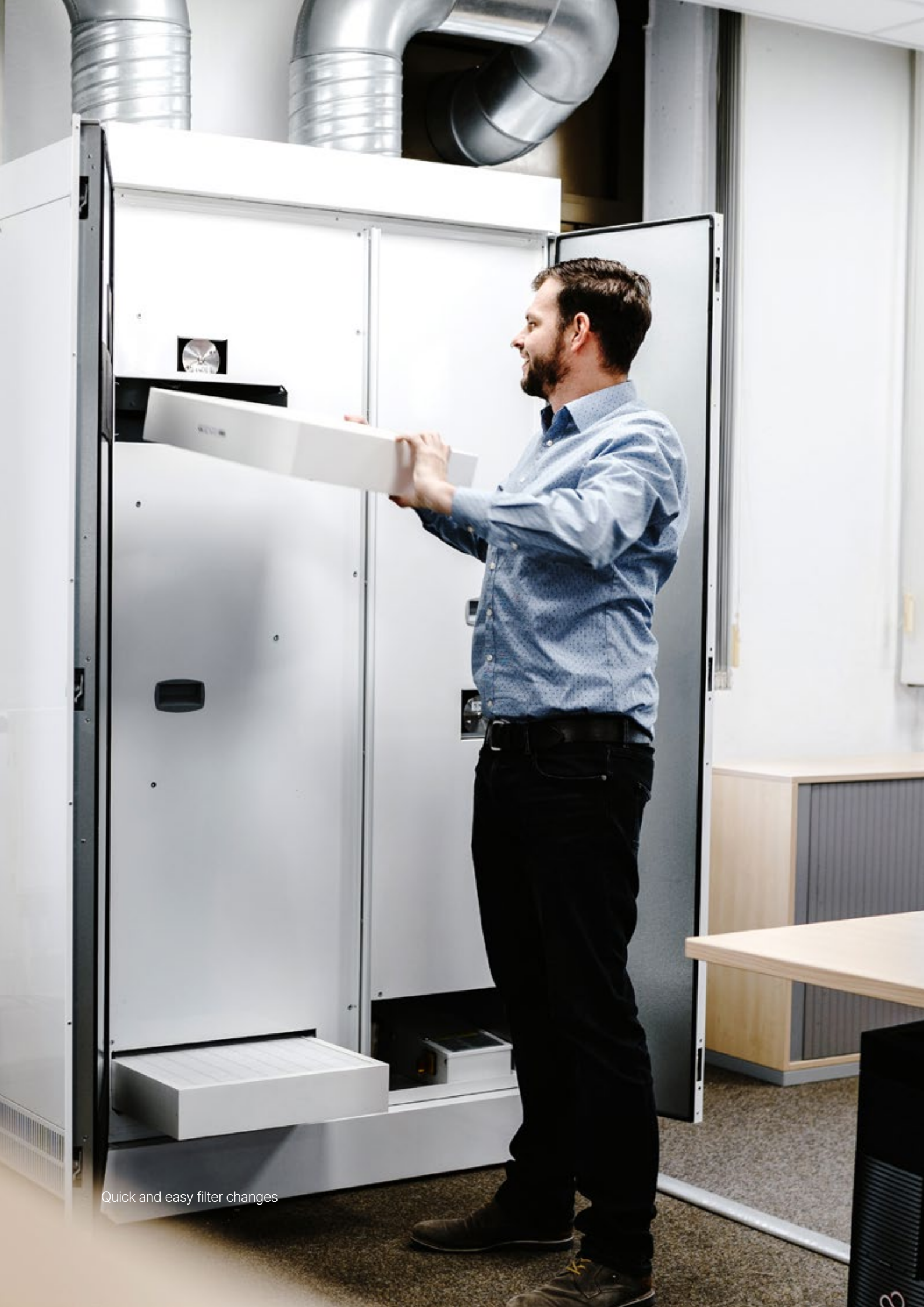
Quick and easy filter changes